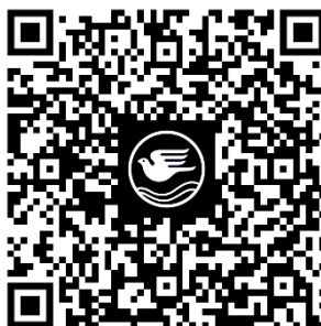
Form 56-1 One Report 2023